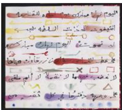
Artist: Etel Adnan

more productive. It informs us that these countries, of which we hear so much these days in the news, are not simply historic sites or “contemporary war zones full of terrorists” but sites of a sophisticated contemporary culture.