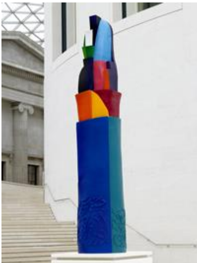
Artist: Dia Al Azzawi