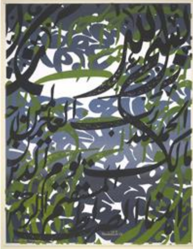
Artist: Charles Hussein Zenderoudi

depleted uranium as a cause of illness and death following the first Gulf War.